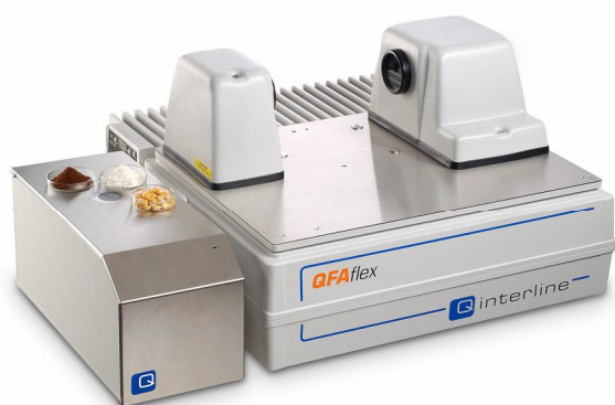
Figure 1: The QFA flex650L

The QFA flex650 is a dual FT•NIR analyser which measures both liquid and powder samples without removing the sampling or optical accessories. When changing between liquid and solid analysis, a simple manual lever is rotated to open or close a shutter between the side port and the top bench. A procedure in the software automatically selects the appropriate configuration.